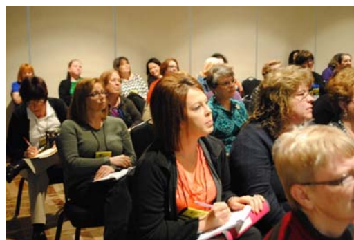
Spring Conference Education Session, Marriott Hotel, Wichita, KS.