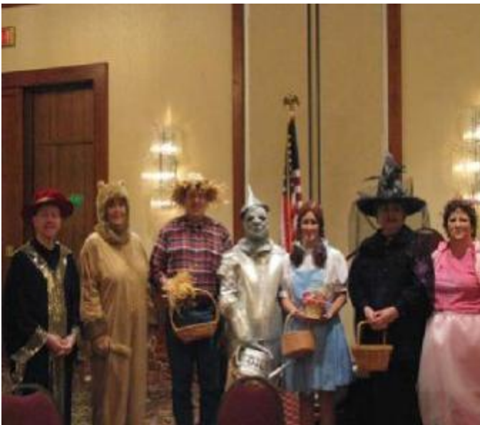
Follow the yellow brick road. A cast of clerk characters make an appearance at the conference.