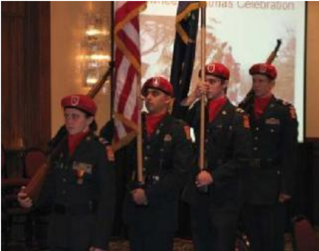
Wichita North High School Junior ROTC presenting the colors for the opening of the Spring 2009 CCMFOA conference.