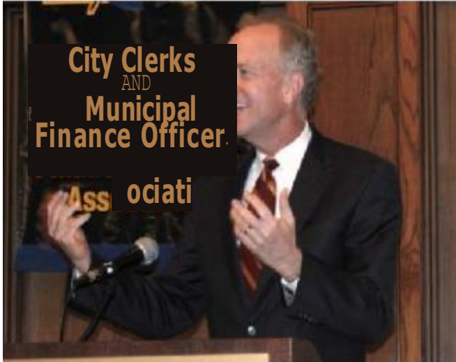
US Representative Jerry Moran giving the 2009 Keynote Address to the CCMFOA membership.