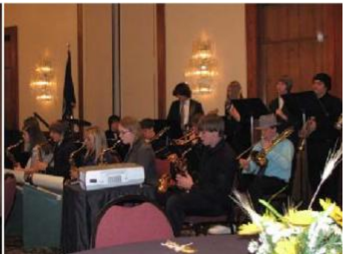
Mulvane High School Jazz Band performing at the opening ceremony.