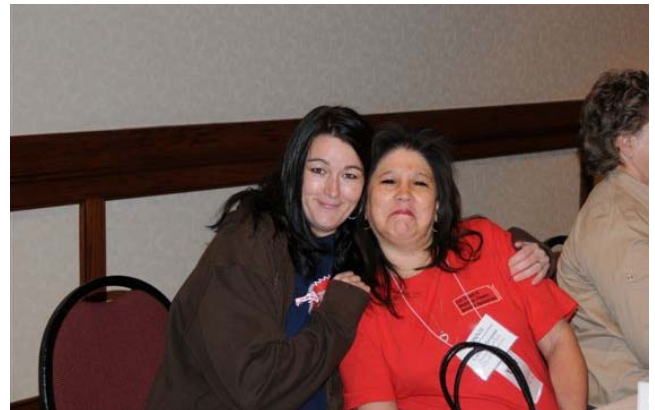
Snap out of it, it's only Capstone!