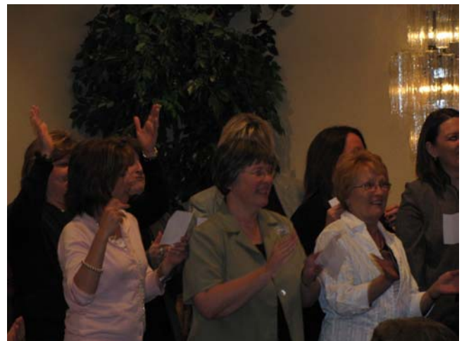
Give yourselves a hand year 2 for an outstanding performance of your class song.