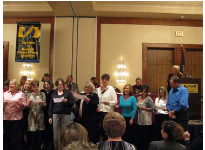
Year 1 performing their class song.