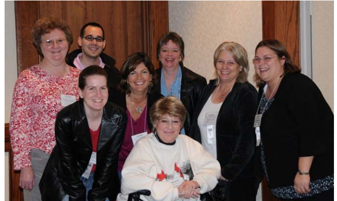
Before Capstone group photo.