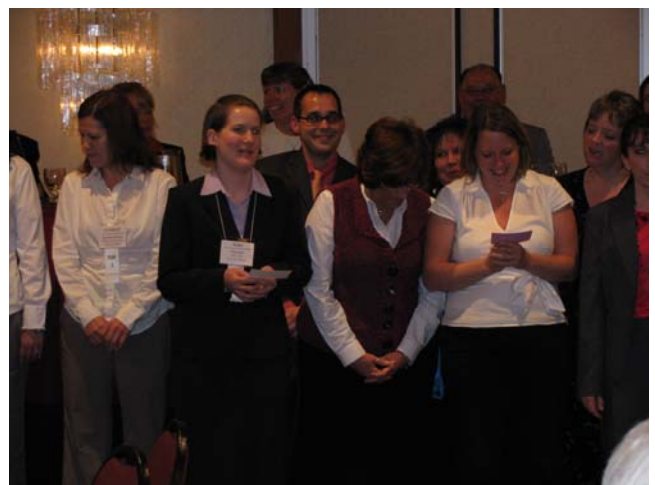
So long, farewell, we hate to see you go... Year 3 graduates doing their class song.