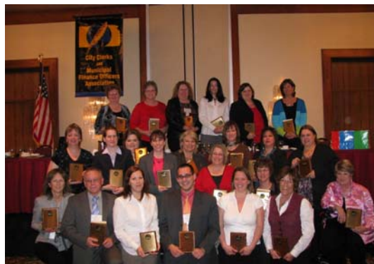
Year 3 Graduation Photo.

Twenty-three municipal clerks completed their third and final year of institute including the capstone course. Six faculty and staff and a professor emeritus from Wichita State University's Hugo Wall School of Urban and Public Affairs were among institute and academy speakers.