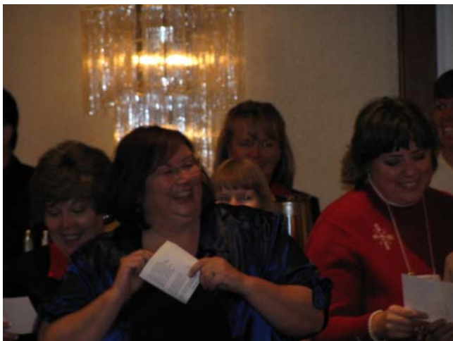
We've got the beat. Year 2 performing their class song.