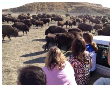
"Buffalo girls won't you come out tonight"